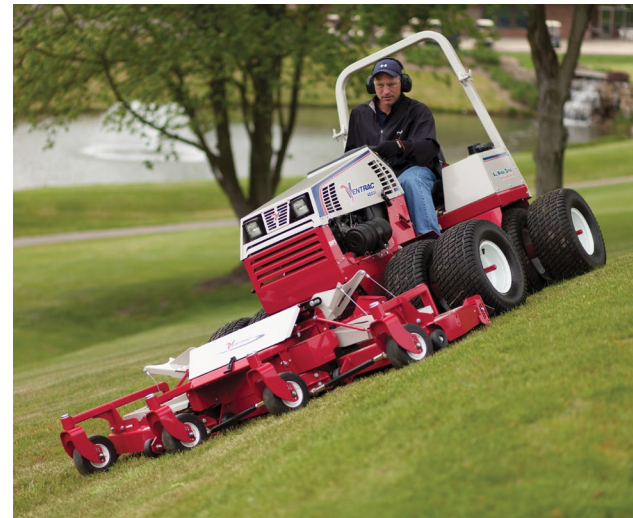
The new Ventrac 4500 tractor is used by landscapers, municipalities, churches, universities, golf courses, homeowners, parks, sport facilities, shopping malls, tree growers, rental yards, nurseries and airports.

Venture used 2D AutoCAD® software from Autodesk for many years. With a power