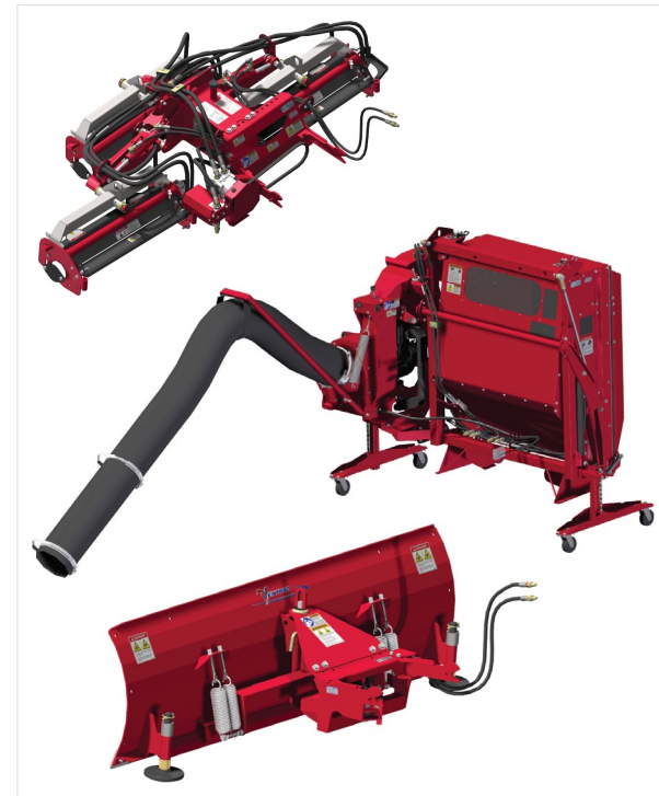
Attachments designed for Ventrac tractors must fit perfectly.