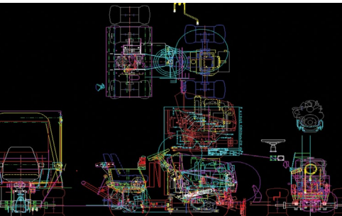
In its old 2D AutoCAD layouts, finding part interferences was impossible and manufacturing often had to build a dozen physical prototypes before it could send a product to market.

negative issues with 2D design still needed to be addressed. That included parts not fitting. It was very difficult to see in the 2D view how parts fit together.”